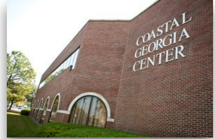
Coastal Georgia Center, 305 Fahm Street, is the site for the 2nd Annual Chatham County Juvenile Court Safety Forum