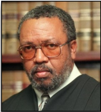
Judge LeRoy Burke III, Chatham County Juvenile Court