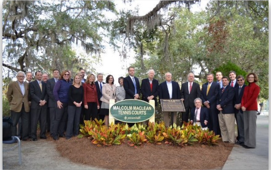
Members of Savannah's City Council and employees of HunterMaclean gather for the dedication ceremony of the Malcolm Maclean Tennis Courts at Daffin Park.