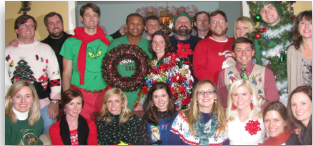
YLD Tacky Sweaters 2010

The YLD is excited to host its annual YLD Christmas Party with the suggested attire of