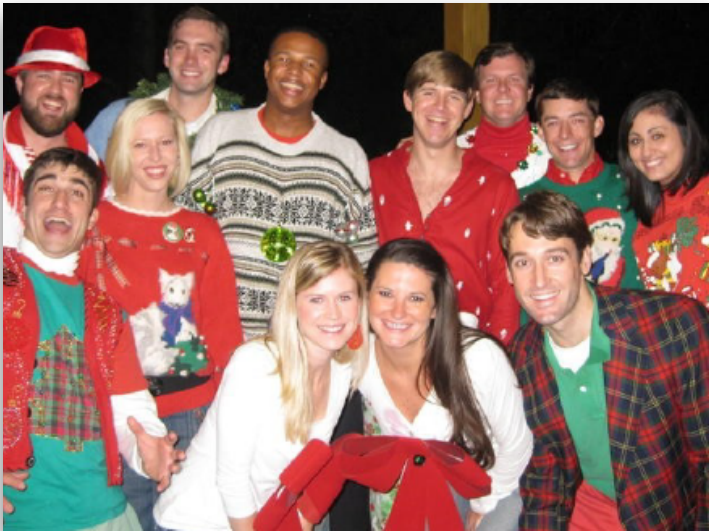
YLD Tacky Sweaters 2009

holiday tacky sweaters on December 17th at 6 p.m. The event will be sponsored by the law firm of Roden + Love, LLC. Be on the lookout for an email invitation with all the details for this much beloved event.