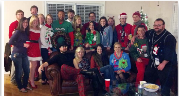
YLD Tacky Sweaters 2012